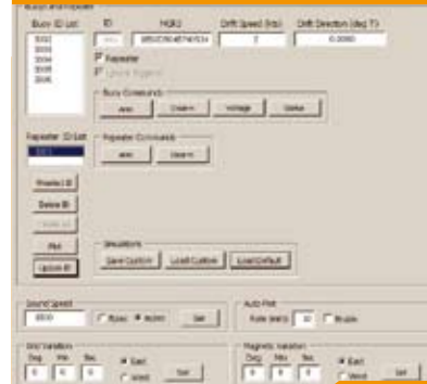
SYSTEM CONTROLLER DISPLAY